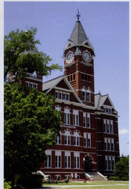
Samford Hall, Auburn Campus

Magnolia, the site of many celebrations and a good place to buy Auburn souvenirs.